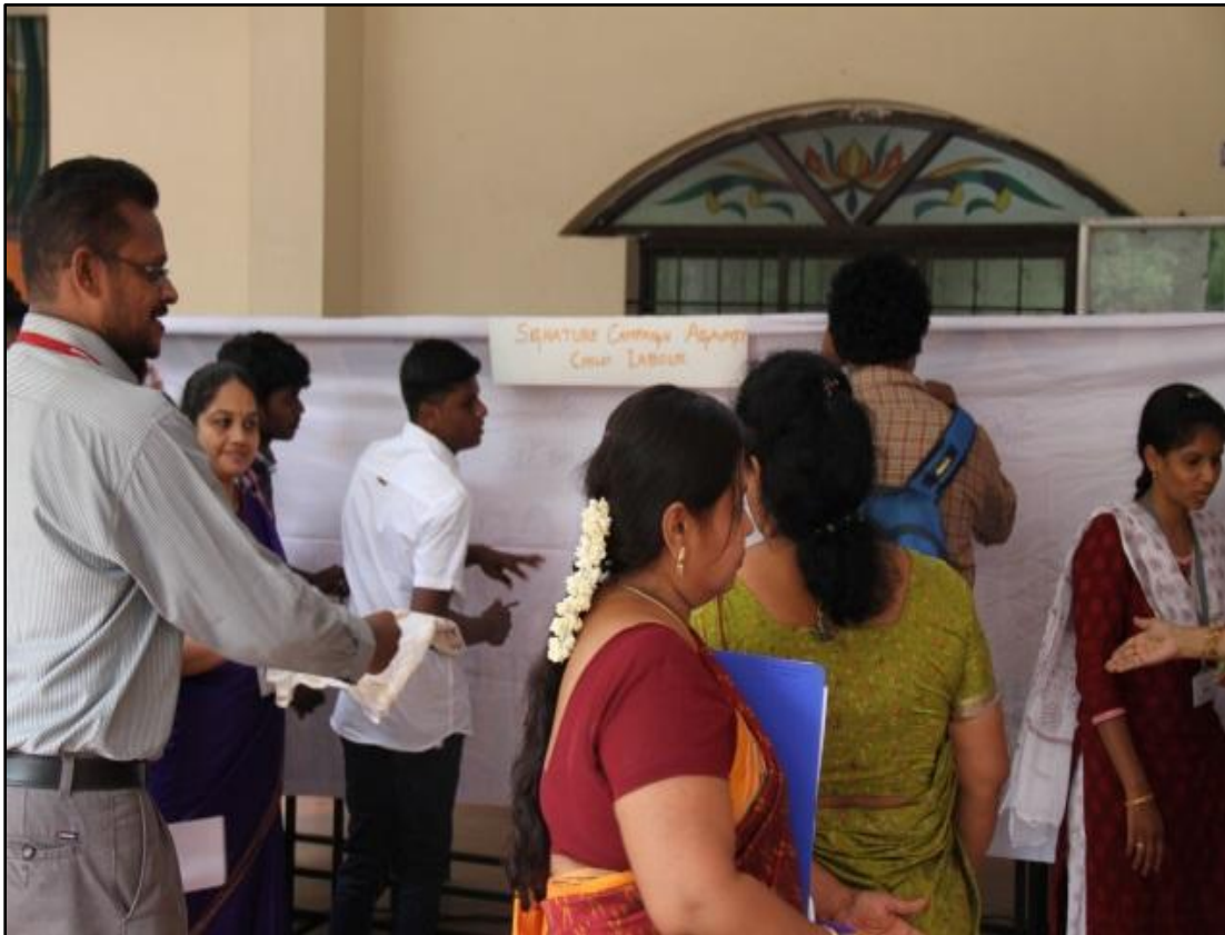
Students and faculty participating in the Signature Campaign against Child Labour

The Department of Social Work took an initiative to campaign against child labour. The programme was to make the students realize the importance of a child's right to education. The Resource person from an NGO, JeevaJyothi gave an informative talk. To create awareness among school students, they initiated a postcard and signature campaign against child labour. The collected post cards were sent to President's office, Delhi.