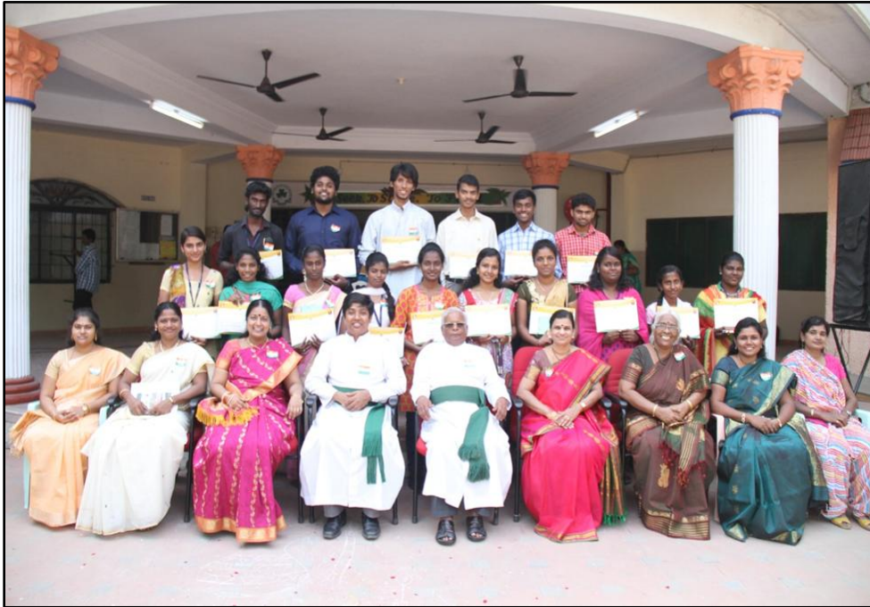
Prize winners of the Republic Day competitions