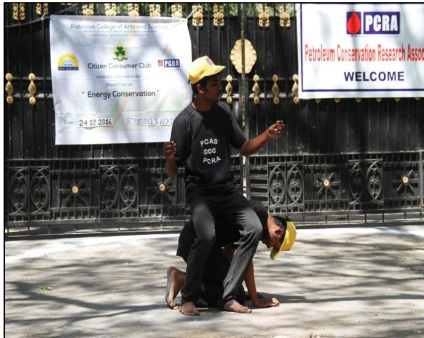
Students creating awareness on Energy Conservation with a street play.

Street Theatre on “Energy conservation “ in association with Petroleum Conservation Research Association (PCRA), Government of India created awareness among the residents of Gandhi Nagar and students of the College on conservation of fuel, electricity, and LPG gas for sustainable development.