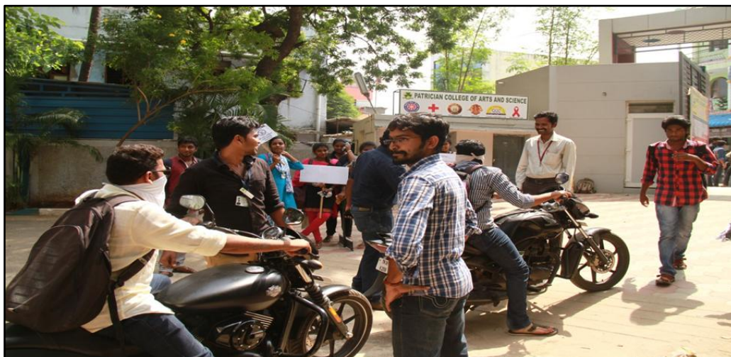
NSS volunteers creating awareness on the importance of wearing helmet